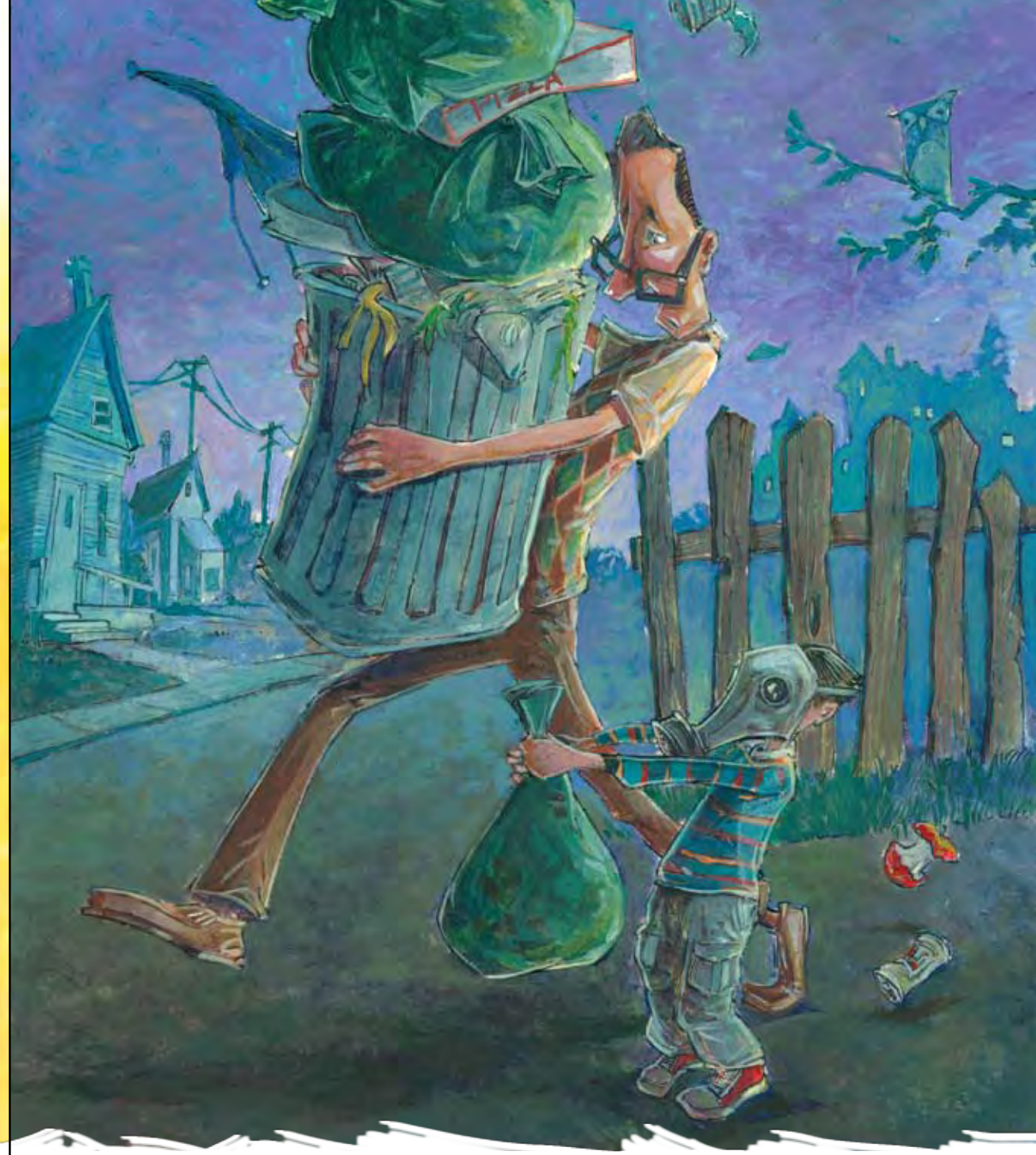
Toss the trash away. It stinks!