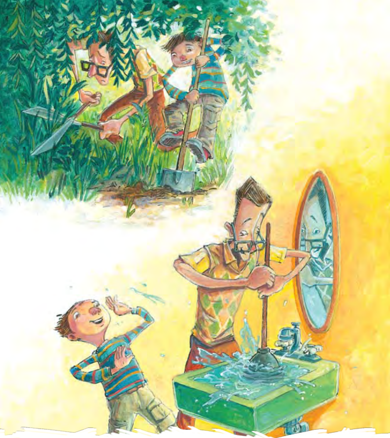
Pull the weeds and clean the sink.